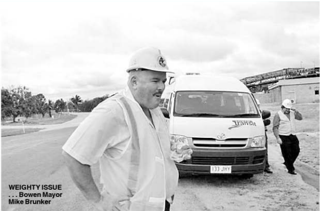
WEIGHTY ISSUE . . . Bowen Mayor Mike Brunker

The pair, who have no trouble adjusting to the creature comforts of five-star travel, were forced to spend one night sleeping on the floor of a railway station in Mumbai after they missed a connection. The night, spent trying to catch 40 winks among the teeming hordes in Mumbai Central, was one of the highlights of their trip.